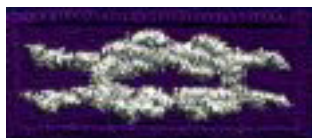
BSA Youth Religious Emblem Knot