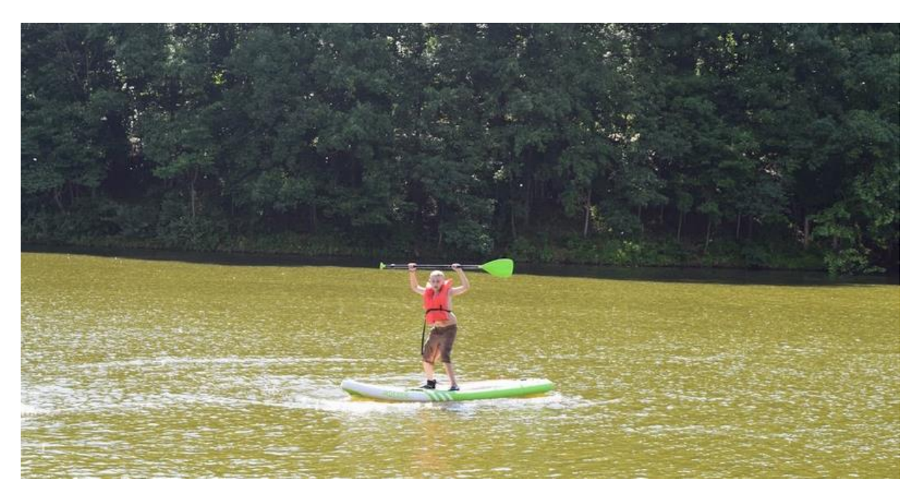
BE SURE TO PLAN AHEAD!!

REGISTRATION FOR 2021 SUMMER CAMP OPENS SEPTEMBER 14, 2020 AT 9:00 AM. REGISTRATION WILL BE AVAILABLE AT: